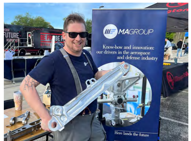
Manufacturing career fairs

For more information, find us at: capefearmfg.com