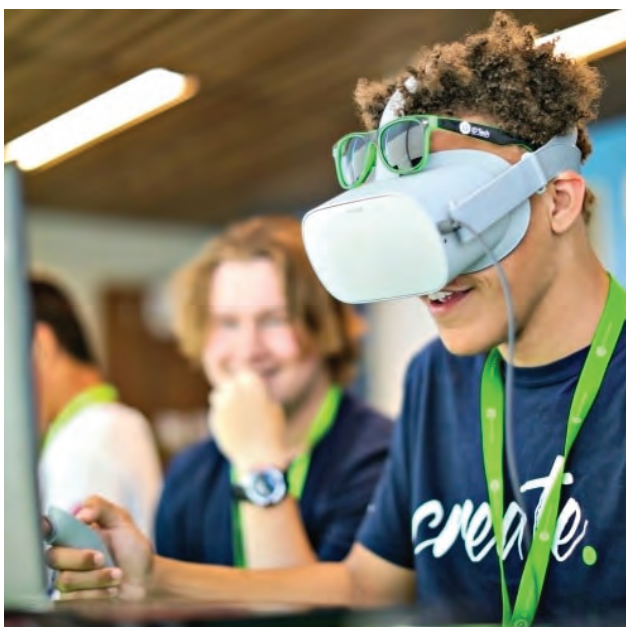
Manufacturing-oriented summer camps