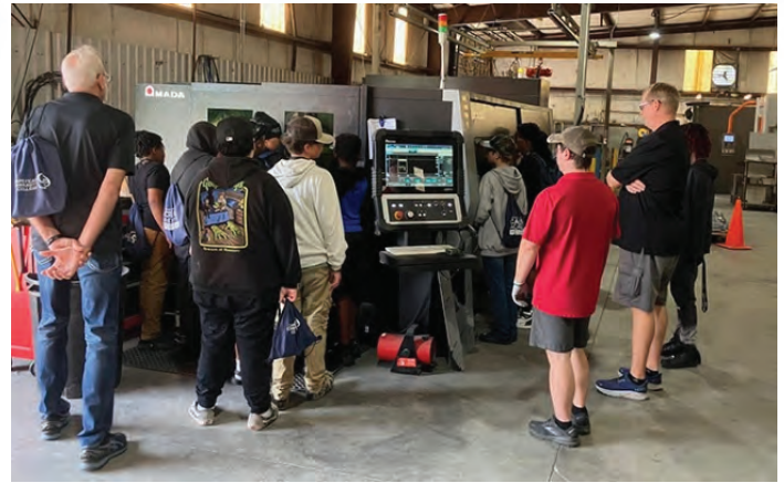
Factory tours for local schools